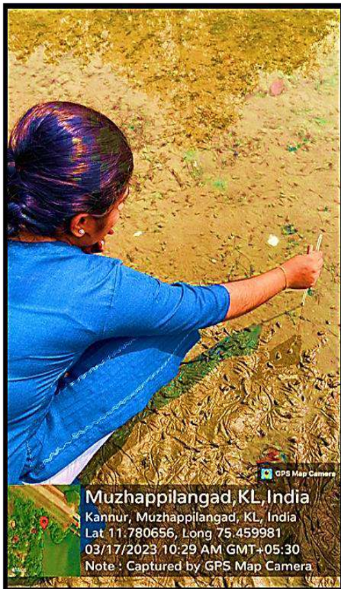
Muzhappilangad, KL, India Kannur, Muzhappilangad, KL, India Lat 11.780656, Long 75.459981 03/17/2023 10:29 AM GMT+05:30 Note : Captured by GPS Map Camera